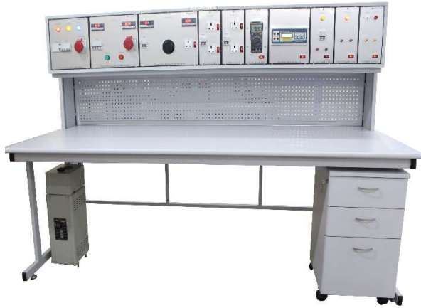
*This image is for marketing purposes; the actual instrument may vary slightly*